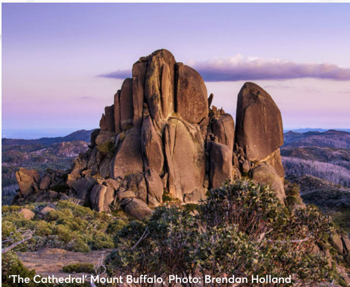
'The Cathedral' Mount Buffalo, Photo: Brendan Holland

The large backyard runs down to the river, ideal for a dip on a hot sunny day or otherwise while away the hours, relaxing on the deck, overlooking the river. The whole house is yours to enjoy.