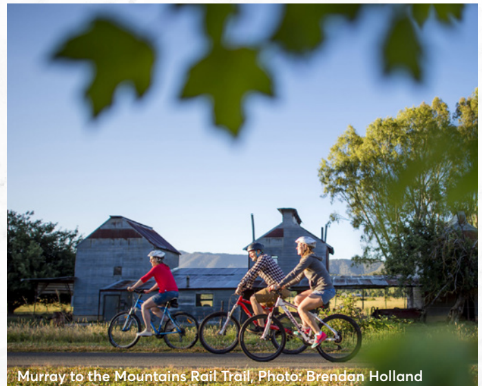
Murray to the Mountains Rail Trail